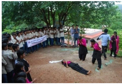
Drug Abuse Awareness Street Play