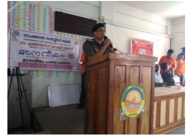
National Disaster Response Force Mockdrill