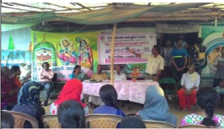
World Senior Citizen Day Observation