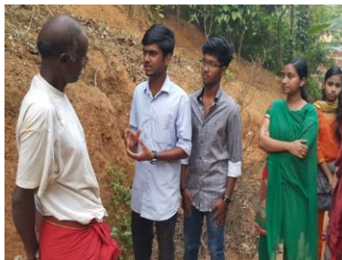
Medical Camp propaganda in Godavari Colony