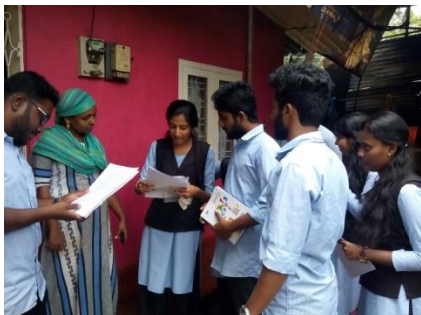
Energy Efficiency Survey