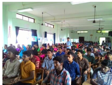
District Seminar on Ozone Preservation