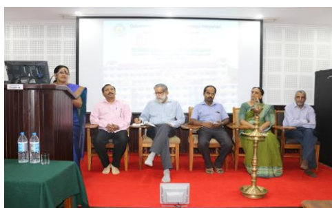
Research Trends in Computer Science