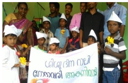
“Oalappeeppi” – Children’s day Observation