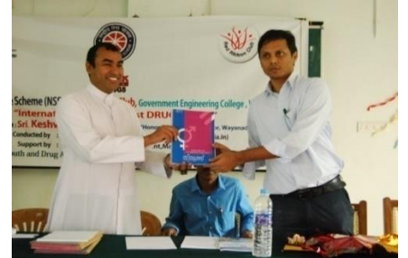
“Thiruth” Manuscript release