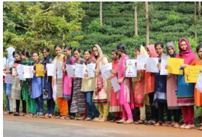
“Manaveeyam” Human Chain