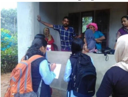
E-Waste Disaster Awareness Campaign