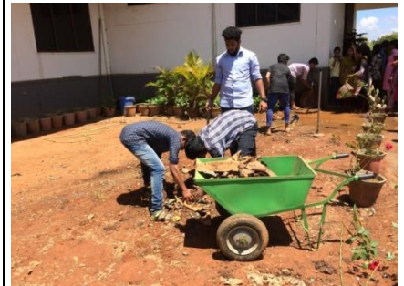
Gandhi Jayanthi Celebration