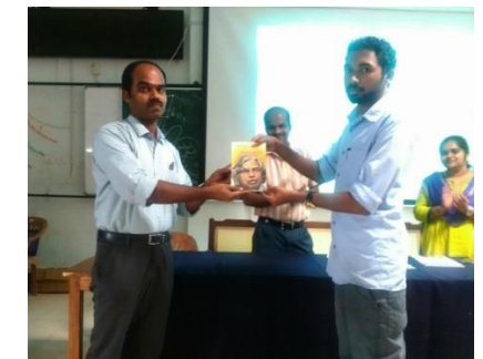
Dr.A P J Abdul Kalam commemoration seminar