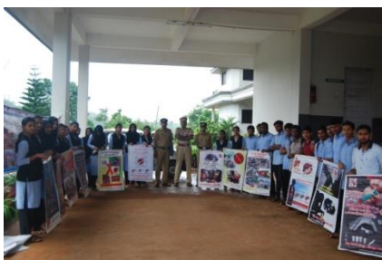
International Day against Drug abuse