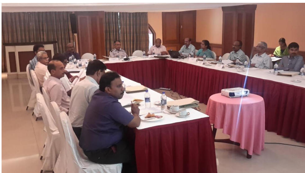
11 th Board of Governors meeting at The Gateway Hotel Calicut