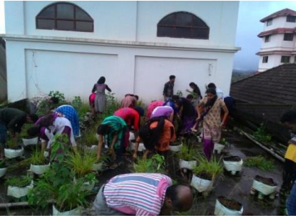
“Sahasramudi” - Three day mini Camp