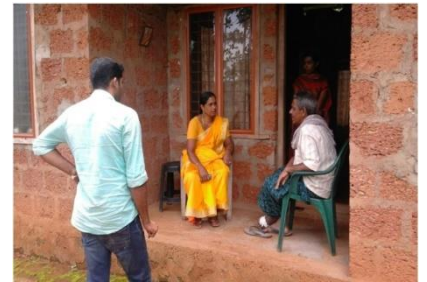
Palliative care home visit