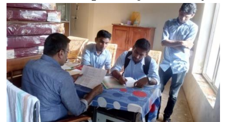
Green Carpet Project Survey