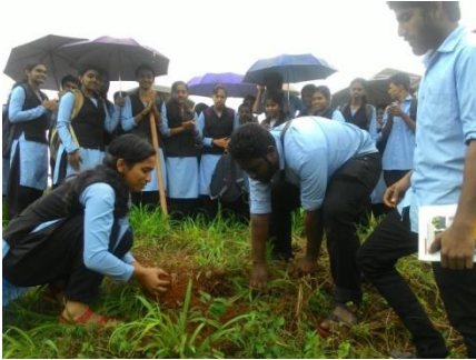
My Birthday an Earth day