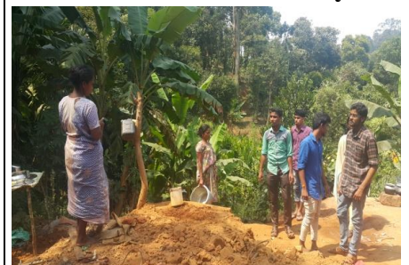
Health camp publicity works at Godavari Colony