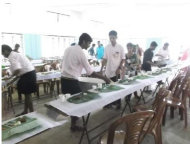
“Onappakittu” - ONAM celebration