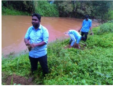
Bamboo Planting for water & watershed conservation