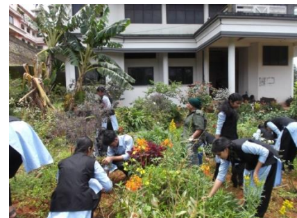
Garden Maintenance Works