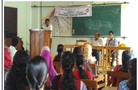
“Nisah 2016” - Woman Empowerment Class