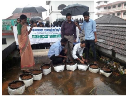
Farmer’s Day observation