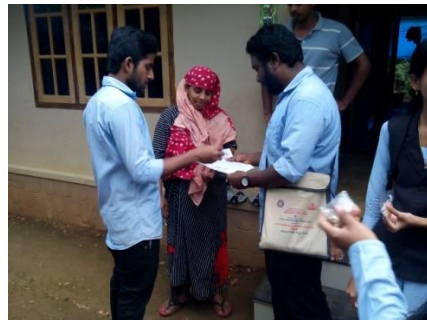
Vegetable Seeds Distribution