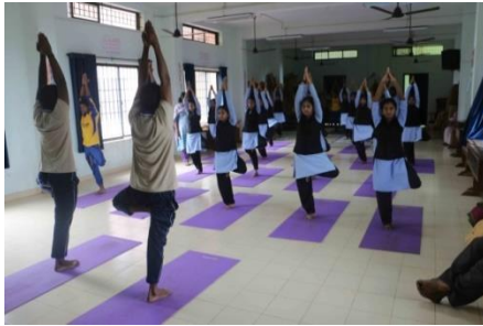
International Yoga Day Observation