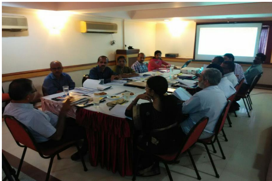
9 th Board of Governors meeting at Calicut