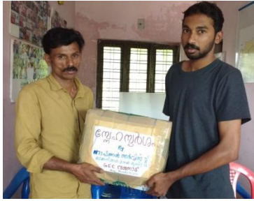
“Snehasparsam” –Note book distribution