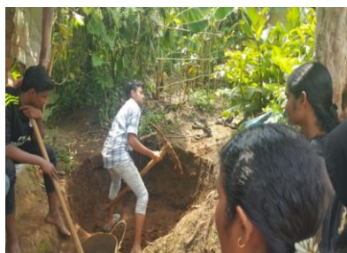
ODF Kerala - toilet work at Panavalli&Thirunelli