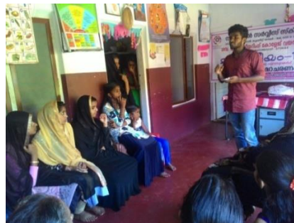
Life style diseases awareness class