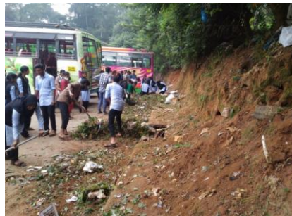
SwachBharath Mission - Bus stand cleaning